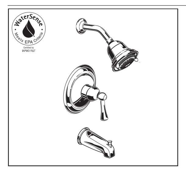
T420.502 Bath/Shower Trim Shown